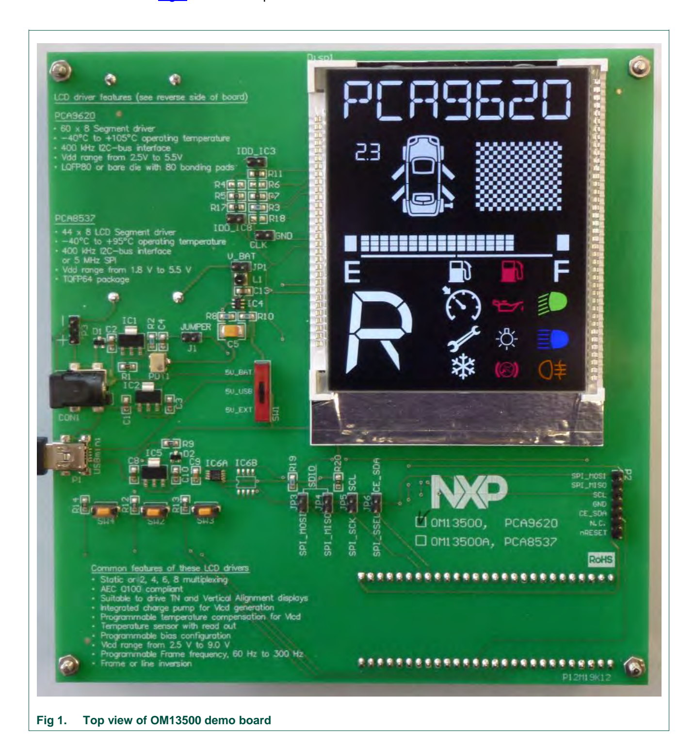
Fig 1 shows the top view of the board.

For best optical performance, remove the protective foil from the display.